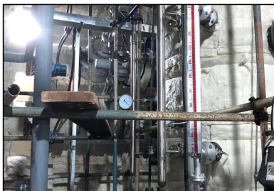
On site of thermoelectric deaerator