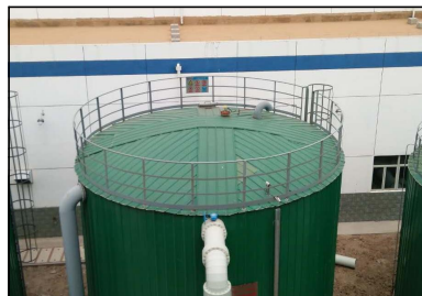
Reverse osmosis water tank